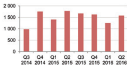
EBITDA (SEK million)*

Administrative expenses for the period, including non-recurring items of SEK 91 million, totaled SEK 318 million (237).